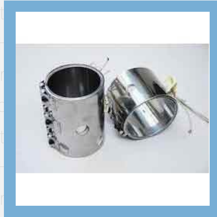
Mica Band Heaters