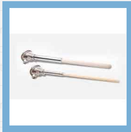
S Type Thermocouples