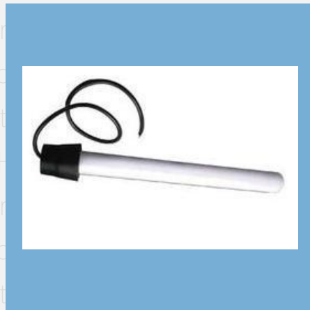
Silica Chemical Heaters