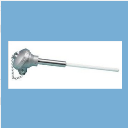
R Type Thermocouples