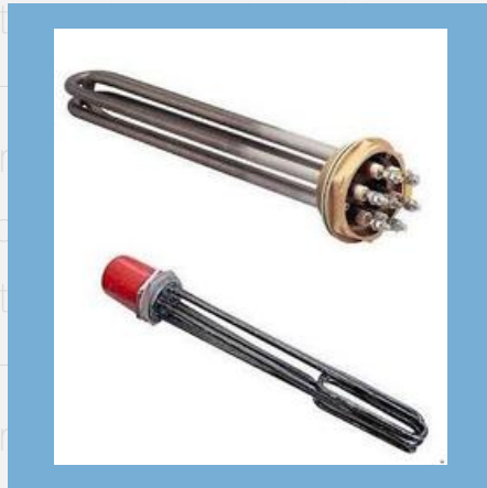
Oil Immersion Heaters