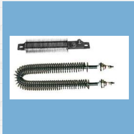
Finned Air Heaters