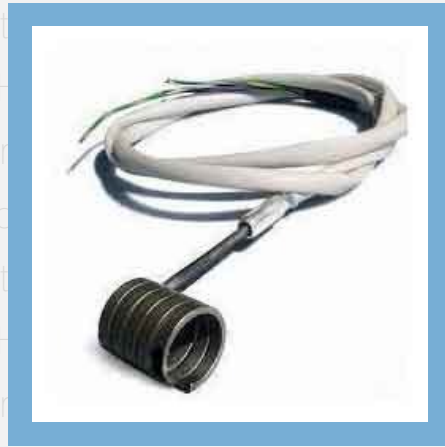
Hot Runner Coil Heaters