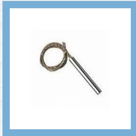
Hi Density Cartridge Heaters