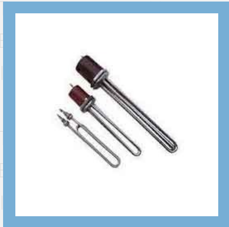
Water Immersion Heaters

Offering you a complete choice of products which include Immersion Heaters such as Water Immersion Heaters, Titanium Heaters, Silica Chemical Heaters, Oil Immersion Heaters, Alkaline Heaters and many more items.