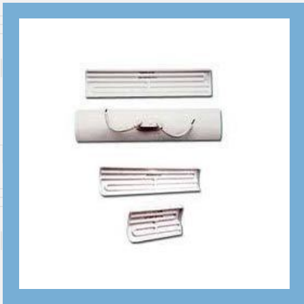
Ceramic Infra Red Heaters