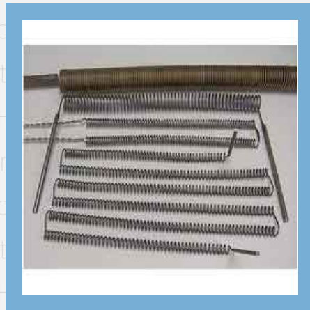
Furnace Heating Elements