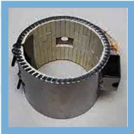
Ceramic Band Heater