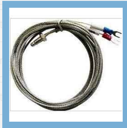
K Type Thermocouples