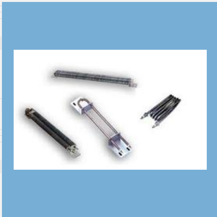
Tubular Air Heaters

We are engaged in manufacturing and supplying a comprehensive range of Furnace Heating Elements, D-Shape Heaters, Finned Air Heaters, Tubular Air Heaters, Heating Elements, etc. These products are widely appreciated in the Industry for durability, high performance and easy installation features.