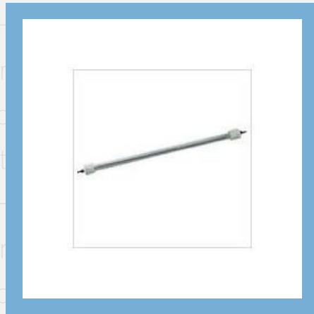
Short Wave Infra Red Heaters