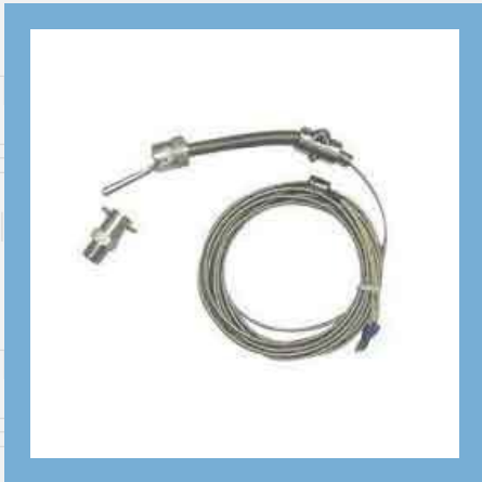
J Type Thermocouples

We are manufacturer extensive range of these Thermocouples , which can also be customized as per the specification give by clients. These are fabricated using best grade raw materials. These are developed as per the clients' requirements and in various sizes.